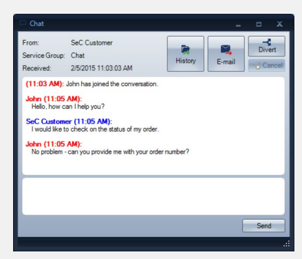
Reduce expensive phone calls by using Web Chat