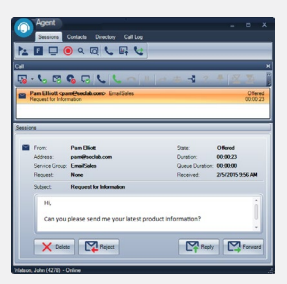
Respond to emails in the most effective way

Agents and supervisors can stay connected from anywhere using a smartphone or tablet