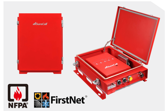
SureCall Guardian3 QR Bi-Directional Amplifier with Nema4 Rated Enclosure