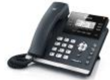
Yealink T4 series