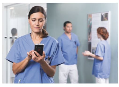
Lets clinicians access and share lab results, images, requests and alerts while on the go.