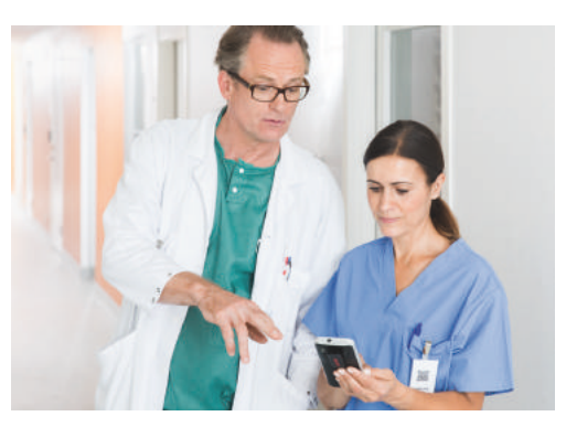
Communicate and coordinate effectively. Requests, messages and tasks go directly to assigned recipients.

Faster availability of clinical information updates