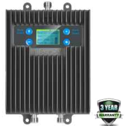
Shown: 5X Max inside host

TECHNOLOGY LEADER — Extended Range Technology combined with 2XP and SureIQ technologies gives 5X Max a clear performance advantage over other commercial boosters. 2XP technology DOUBLES uplink transmission power back to the cell tower ensuring a strong phone-to-tower connection even in weakest signal environments. SureIQ automatically optimizes incoming signals, preventing shutdown and ensuring 24/7 uptime with continuous peak performance in both urban and rural areas.