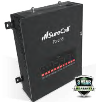
The SureCall Force8 Industrial Amplifier

* Performance and coverage area are dependent upon the strength of cell signal outside of the building and density of structure and materials inside of the building.