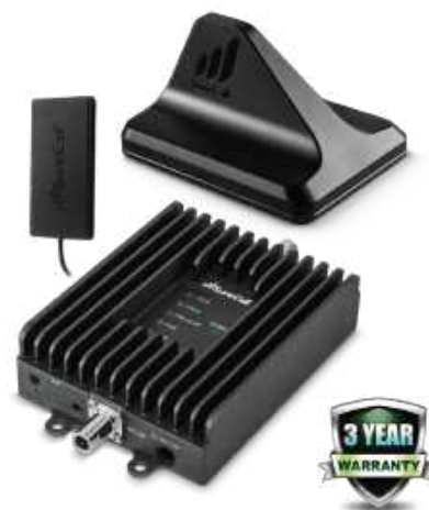
Shown: Fusion2Go Max