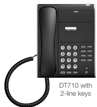
DT710 with 2-line keys