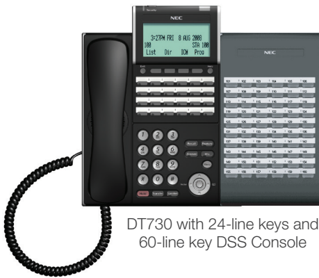
DT730 with 24-line keys and 60-line key DSS Console

Most UNIVERGE Desktop IP and Digital Terminals are available in black or white.