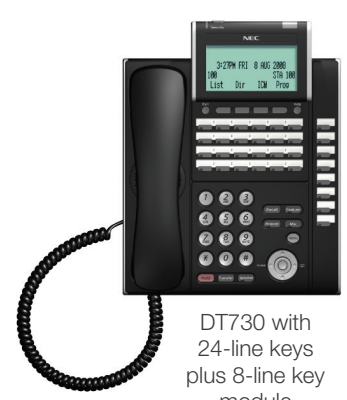
DT730 with 24-line keys plus 8-line key module