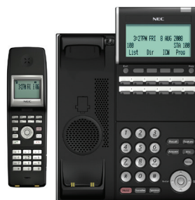
DT330 with Bluetooth Cordless Handset