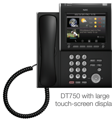
DT750 with large touch-screen display