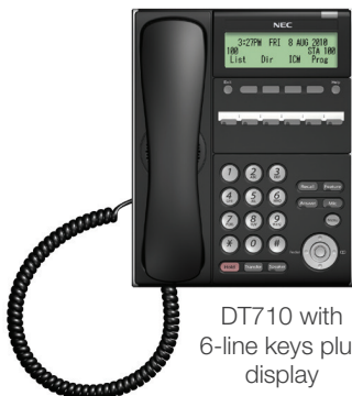
DT710 with 6-line keys plus display