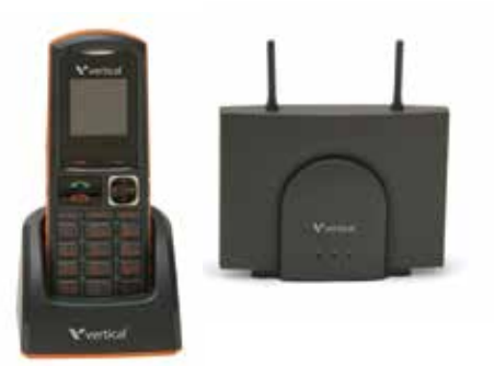
Summit Wireless DECT System

The Summit is also compatible with Vertical's SBX IP and MBX IP platforms, so you can quickly network up to 250 sites together while creating a simple migration path to the full-feature and cost-saving benefits of the Summit's built-in VoIP technology.